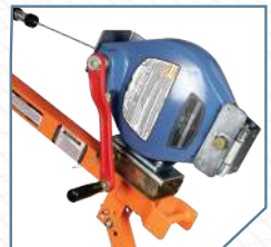
7281DG 60' 3-way SRL-R