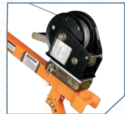
7297 60' Personnel Winch