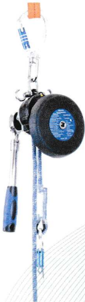
Figure 1: Descender device, type: UNIDRIVE