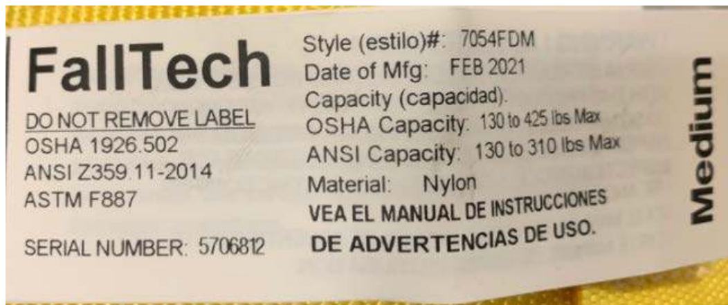
Figure 3.1: Sample photo of Identification Tag

Sample description: Falltech, Harness Sample identification: Style 7054FDM Manufacturer: Falltech Material of webbing: Yellow Nylon with Nomex Kevlar Ripstop Leg and Shoulder Yoke Pads Number of samples tested: 12 Deviations: None Note: Product modified from as-received state. Suspension Trauma Safety Strap Packs removed from harness prior to testing, as requested by the manufacturer.