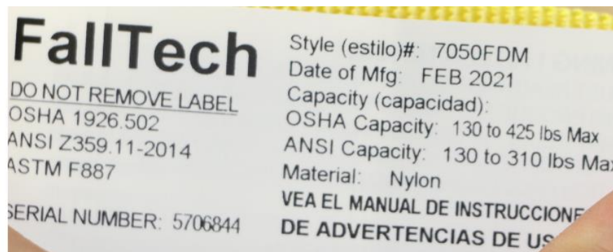
Figure 3.1: Identification Tag