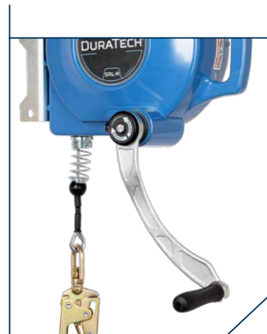
Handle shown in use position

ANSI Z359.12 compliant load indicating swivel snaphook