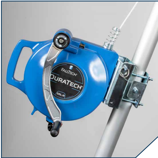
SRL-R shown mounted on a Tripod System (7275)