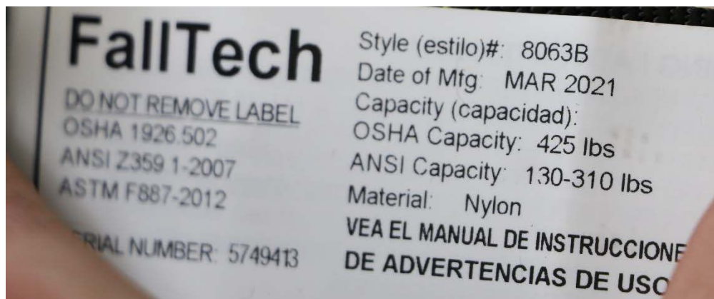
Figure 3.1: Sample photo of Identification Tag