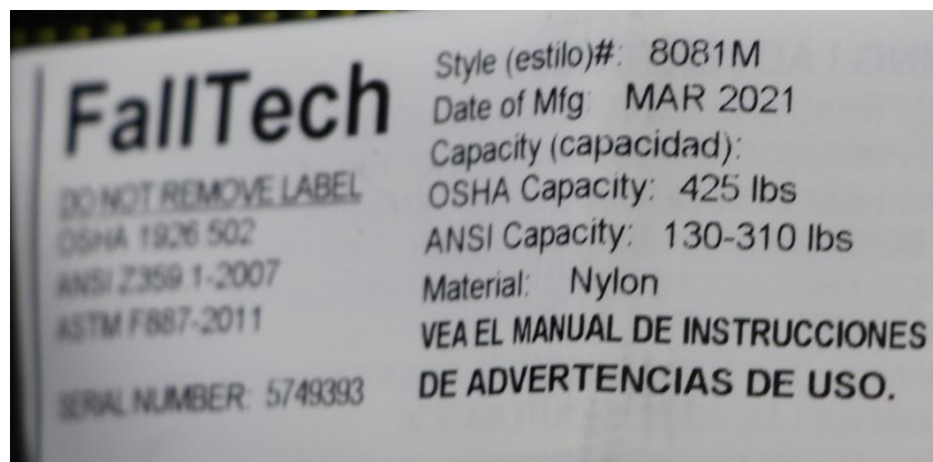
Figure 3.1: Identification Tag