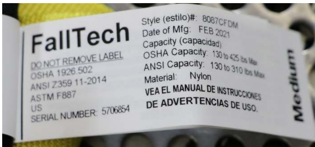
Figure 3.1: Sample photo of Identification Tag

Sample description: Falltech, Harness Sample identification: Style 8087CFDM Manufacturer: Falltech Material of webbing: Yellow Nylon Number of samples tested: 12 Deviations: None