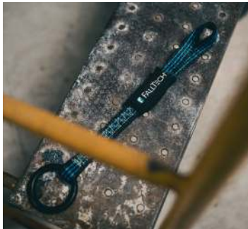
8365LD 18" EdgeCore Dorsal D-Ring Extender with Loop and Dielectric O-Ring