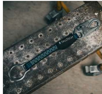
8365 8" EdgeCore Dorsal D-Ring Extender with Snap Hook