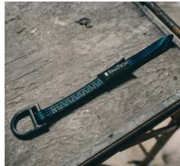
8365L 18" EdgeCore Dorsal D-Ring Extender with Loop