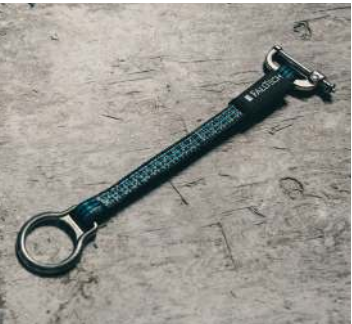
8365P 18" EdgeCore Dorsal D-Ring Extender with Dorsal Connector

Engineered to handle the toughest environments while ensuring maximum safety.