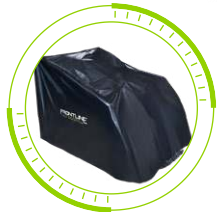
WEATHER PROTECTIVE COVER

TOTAL NUMBER OF USERS: FALL ARREST: 2 FALL RESTRAINT: 2 PATENT PENDING