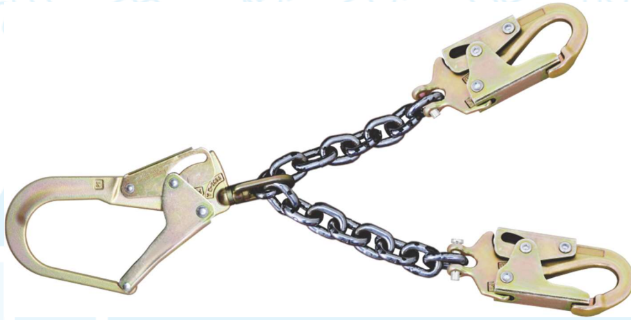
Figure 2 – Lanyard/positioning lanyard described as “PSSW2R”