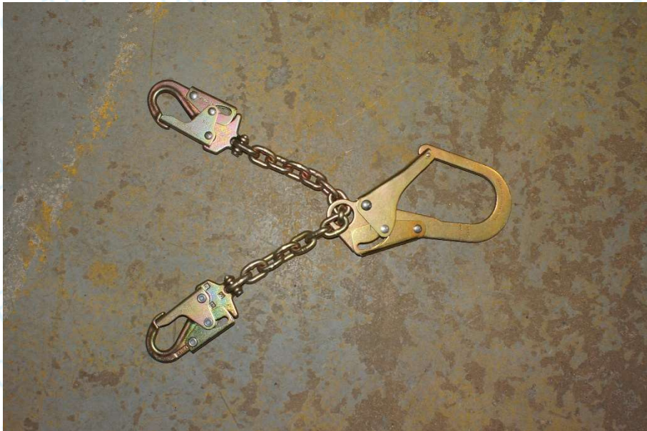
Figure 1 – Lanyard/positioning lanyard described as “FAP 30598”

Samples were tested as received, and were not subject to any pre-conditioning processes other than those stated in individual test clauses