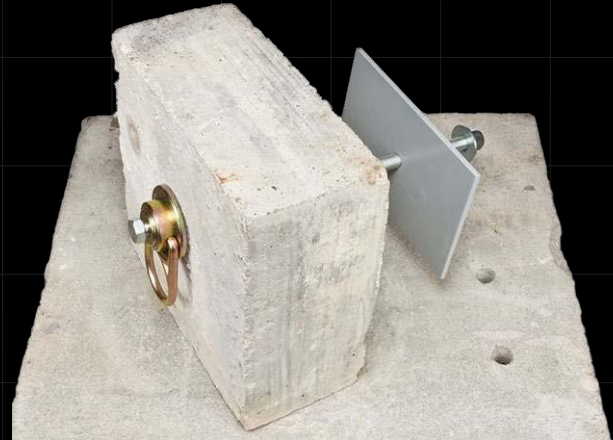
Plate Mild Steel Coating Powder Coat